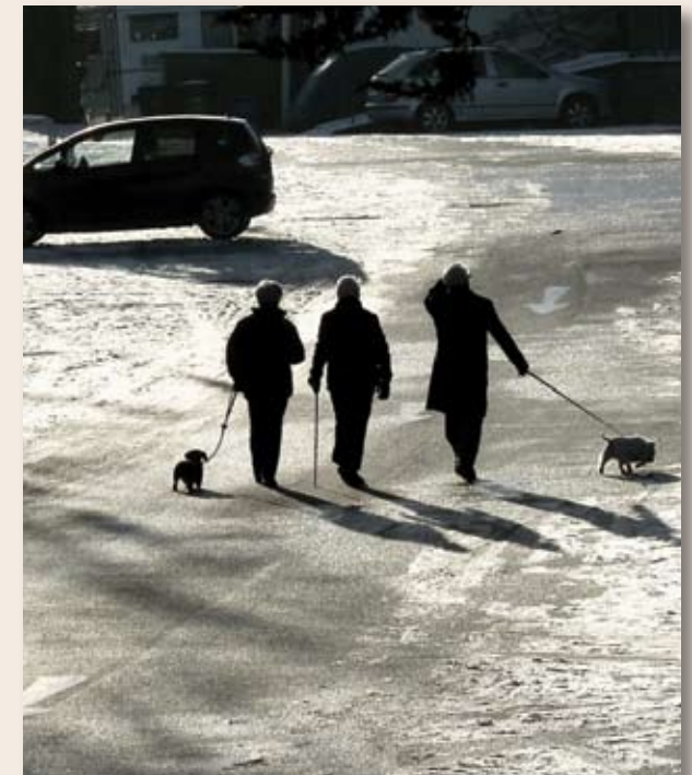
Walking in snow