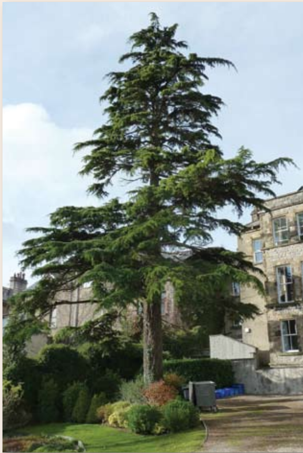
Deodar Cedar ( Cedrus deodara )

Tender plants and shrubs back the Promenade walk with panoramic views across the bay.